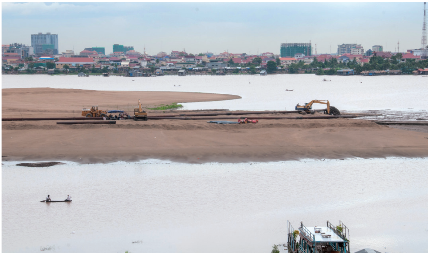
Filling of Boeung Kak Lake in Phnom Penh

income received by the PPWSA from water bills is allocated to the sewerage system and wastewater treatment. Furthermore, it is not possible to determine whether these allocated funds actually end up being used for the maintenance and improvement of relevant infrastructure. The MPWT has the overall responsibility for wastewater treatment and financing. However, there are no streamlined procedures for establishing plants and little expertise is available. Therefore, in addition to financing, another challenge is the lack of institutional capacity.