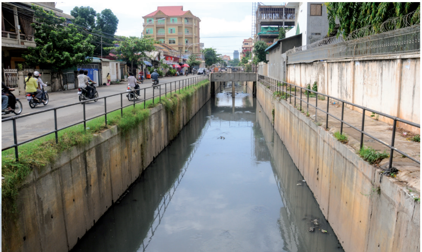
Open Sewer in Phnom Penh

Huge investments are needed for the installation of wastewater treatment plants in large cities. However, the sector is seriously underfinanced. For example, in Phnom Penh, only 10% of the